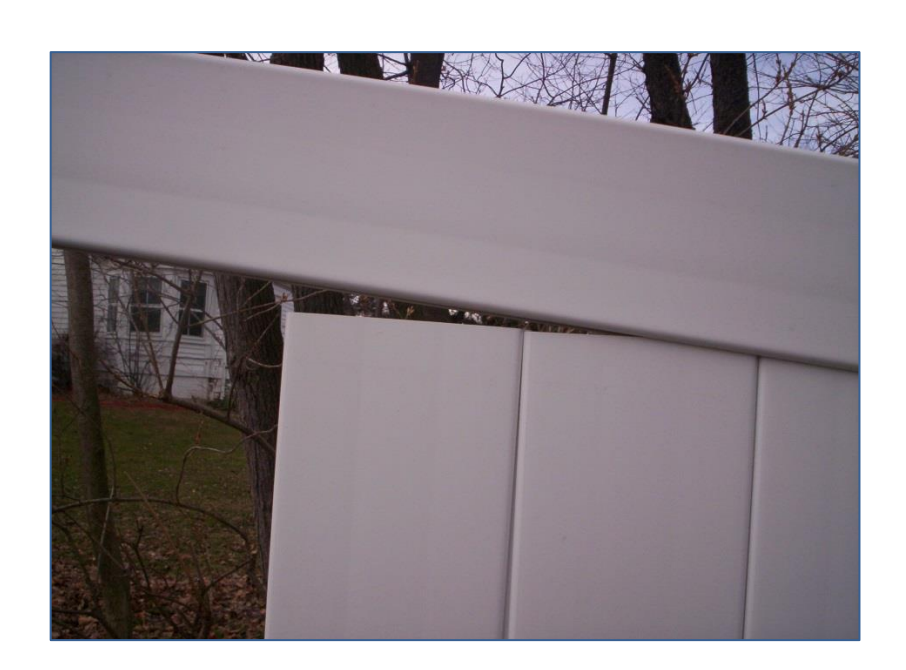
At this point, the top rail is carefully slid off the top of the post where it was placed earlier and allowed to rest on the pickets that have just been installed.