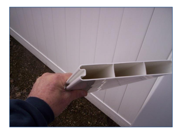
Holding the picket with 'U' channel on it at an angle, place the bottom corner into the slot of the bottom rail, align the top of the picket with the slot in the top rail and move the picket into the vertical position with the 'U' channel flush against the post.