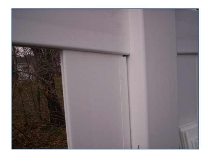
Continue to install more pickets until you reach the point where the space between the rails is too great for the top of the picket to slide into the top rail and remain upright.