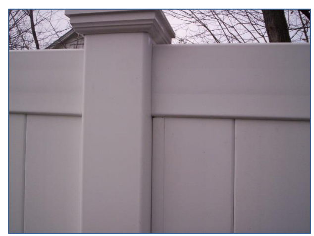
profencesupply is a proud distributor of these fine fence products:

Illusions Vinyl Fence, Grand Illusions Color Spectrum Color Vinyl Fence Products, Grand Illusions Vinyl Woodbond Woodgrain Vinyl Fence Products, Illusions Vinyl Railing System, Eastern Ornamental Aluminum Fence Products, Eastern White Cedar Brand Wood Fence Products, System21 Chain Link Fence, Ameristar Fence Montage Steel Fencing, OnGuard Fence Systems Aluminum Fence.