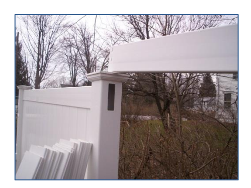
Note the difference in the picket edges, most vinyl privacy fences use 'tongue and groove'.