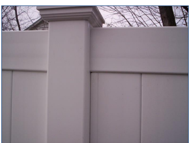
profencesupply is a proud distributor of these fine fence products:

Illusions Vinyl Fence, Grand Illusions Color Spectrum Color Vinyl Fence Products, Grand Illusions Vinyl Woodbond Woodgrain Vinyl Fence Products, Illusions Vinyl Railing System, Eastern Ornamental Aluminum Fence Products, Eastern White Cedar Brand Wood Fence Products, System21 Chain Link Fence, Ameristar Fence Montage Steel Fencing, OnGuard Fence Systems Aluminum Fence.